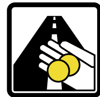
Road sign Toll Road

Based on maps from the Stockholm City Planning Administration. The map has been modified by the SRA. © Vägverket 2005-04-25. Rev. 2005-11-18